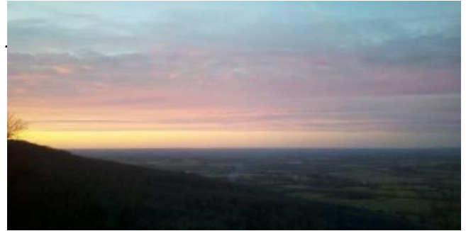
Sewanee Sunset — January 2012

I can draw a parallel here to the way we read and interpret scripture. Three of us can sit at the table,